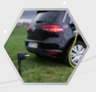
2012 FIRST CONTACT TO THE AUTOMOTIVE INDUSTRY